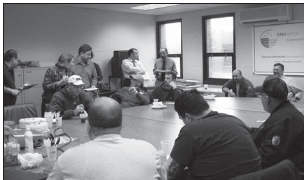
New Haven staff and our client celebrated Earth Day together, learning ways to practice sustainability in day-to-day activities.

Look for more Earth Day coverage in the July issue of Of Mutual Interest , including clean-up celebrations in Milton, Ga., and Centennial, Colo.