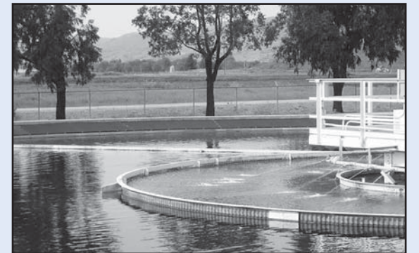
Covers added to the Gilroy/Morgan Hill secondary clarifier helped reduce the amount of algae growth and person hours needed to tend to the issue.