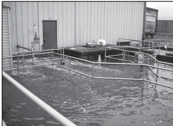
The screw pump works to reduce water on the wastewater grounds from the overflow pipe and aerated grit tanks.

And in Oregon, the temperature dropped to sub-freezing levels for two weeks. Between the rain and thawed snow and ice, some projects accumulated nearly 4 feet of precipitation. To keep the projects running smoothly, associates responded to equipment failures and erratic callouts for 4 days and nights.