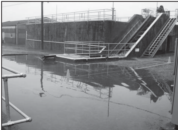
Rain overflows West Liberty’s aerated grit tanks, which can handle approximately 6-mgd.

To handle the flooding, associates turned off aerators to the activated sludge system and used the sludge tanks as large clarifiers during the overflow period. The clear water was then discharged to the final clarifiers to reduce the number of back-ups in the collection system.