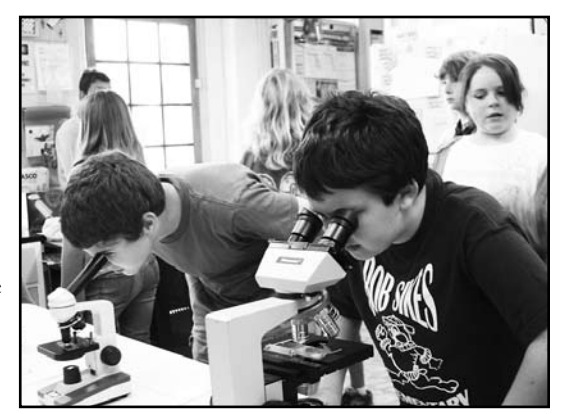
Students use microscopes to view organisms during a tour of the DeFuniak Springs, Fla., wastewater plant.