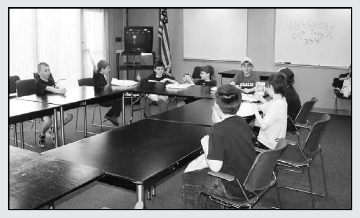
video, asked lots of questions, and received an extensive tour.