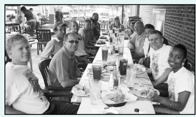
Celebrating National Public Works week as a dedicated public works team.